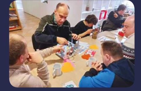
60,000+ citizens of the Region got access to better municipal services

800+ vulnerable citizens received community-based services that improved their wellbeing and integration