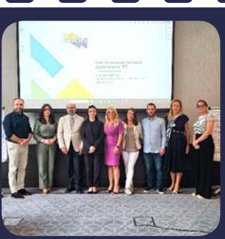
NALAS Forum of Women Mayors' recommendations on gender equality at local level were integrated in the Berlin Forum recommendations addressing the gender gaps in the Berlin Process