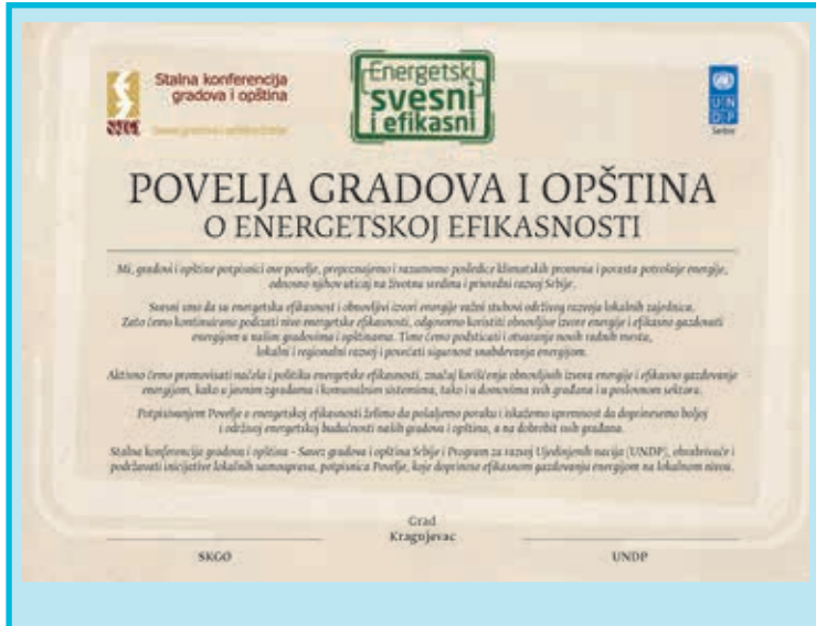
Figure 3. Local Energy Efficiency Charter that was signed by more than 50 cities in Serbia

Disseminate information on good practice of EE applications from other municipalities thus creating demand for local policy level measures, as well as a sense of competition between the local governments and peer pressure.