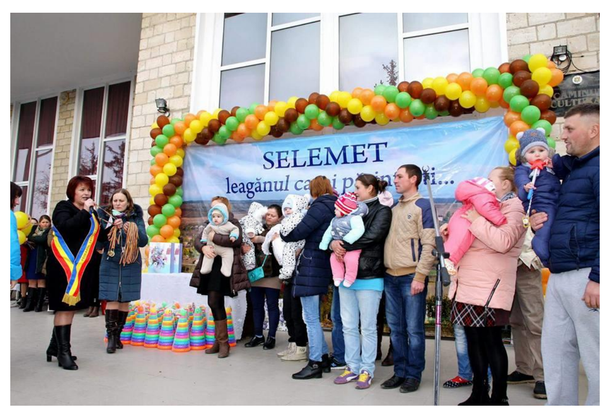
JJ: You often emphasise that you are not politically affiliated, that makes it very difficult to attract funding from the state budget. This "weakness" made you think outside the box and focus on attracting foreign investments, thanks to which you achieved remarkable changes in your community. What is your key to success in mobilising diaspora?

"The biggest achievement is that we managed to consolidate the community and the diaspora in order to mobilise and get involved in all local processes and development projects of Selemet"