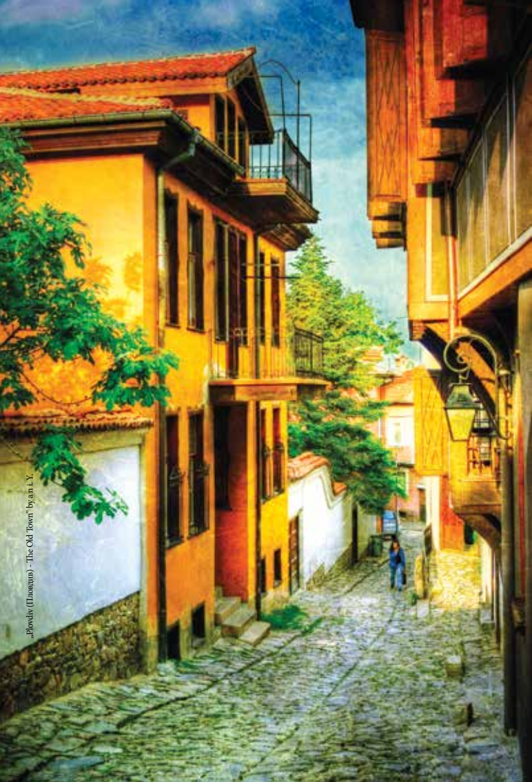
„Plovdiv (Пловдив) - The Old Town“ by a.n.l.y.